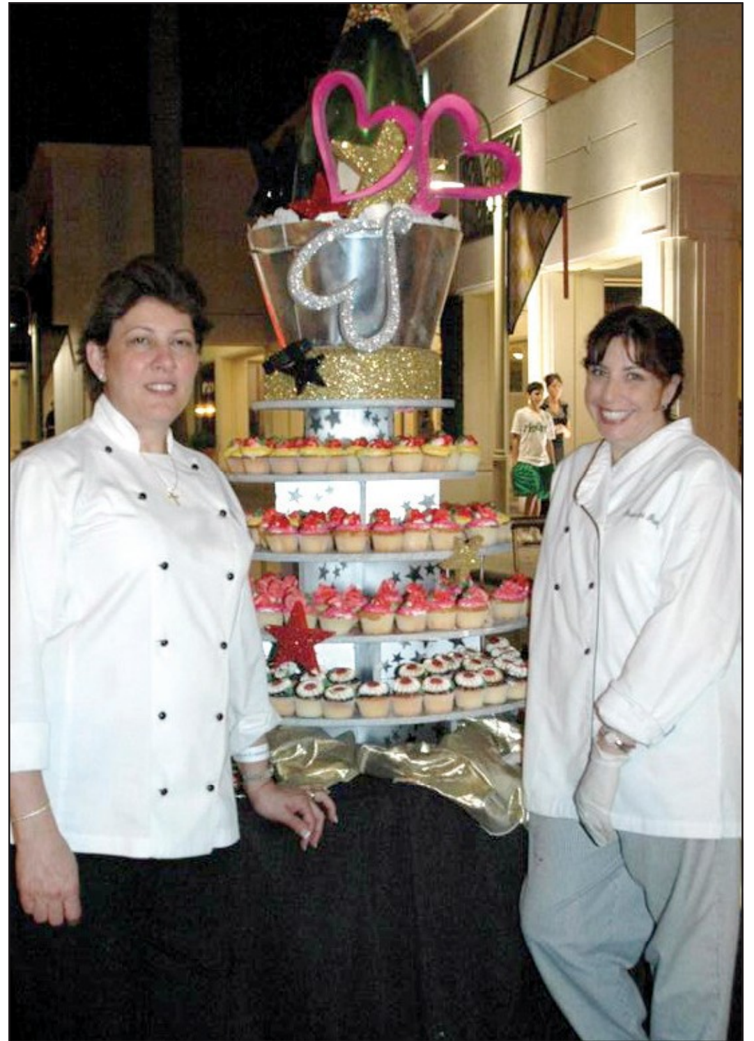
Passion for Pastry Chefs, first place award winners for presentation.