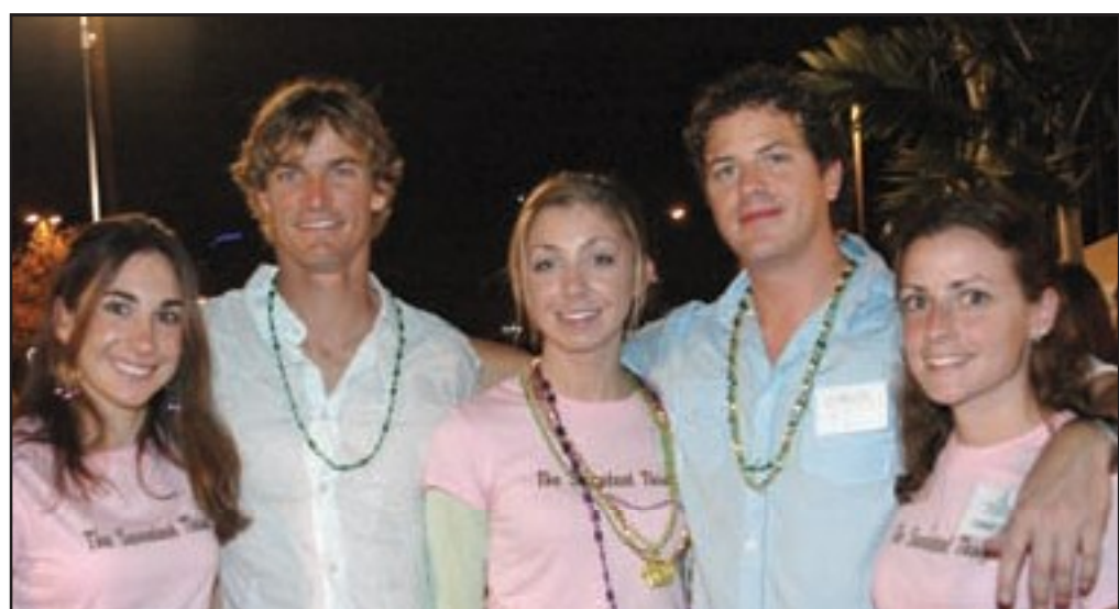
Emi Marino, event bachelor, Schuyler Thompson, event bachelor, Kelly Clark